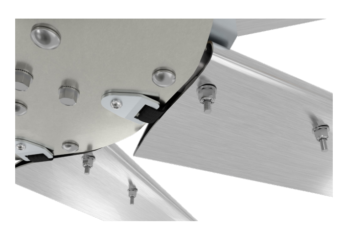
Hub Attachment Point