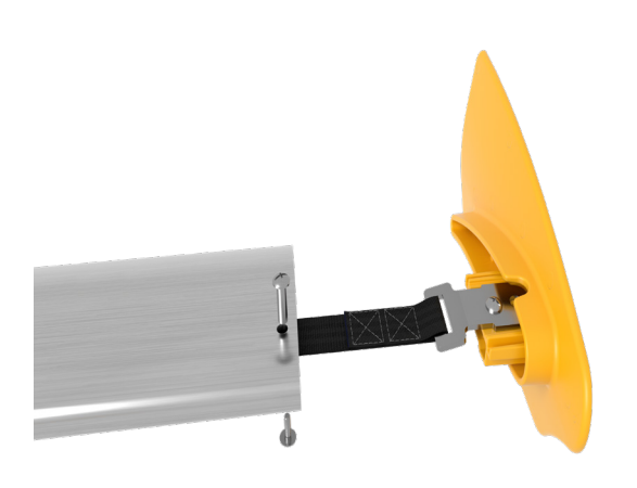
Airfoil Attachment Point