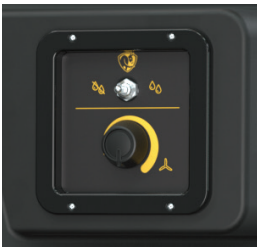
Onboard Variable Speed Control