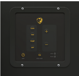
Optional Connected Controller Upgrade